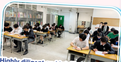
Highly diligent and intelligent students were working their way through difficult Sudoku puzzles