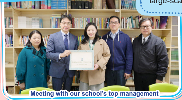
Meeting with our school's top management

As part of the Catholic School Leadership Development Programme, a teacher from St. Joan of Arc Secondary School visited our school from 4 March to 5 March 2024. The visit included meetings with our school's top management and relevant team heads, observing lessons and participating in large-scale school activities.