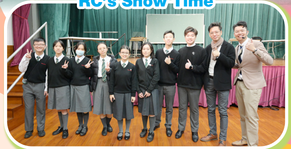
RC's Show Time