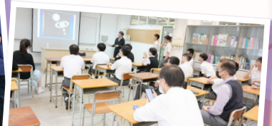
Students enjoying a taste of star-gazing and astronomy.

We know that all things work for good for those who love God, [6] who are called according to his purpose. (Romans 8:28)