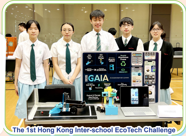
The 1st Hong Kong Inter-school EcoTech Challenge