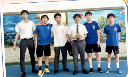
Heated match during the Inter-house Ancient Chinese Football Competition.

Integrated Humanities subject teachers strung together a series of interesting and engaging activities for students across all forms during the Integrated Humanities Week from 9 to 12 April 2024. The series of events include a Green Consumer Exhibition, open exhibition of the school's Chinese & Foreign Cultural Relics Gallery, Inter-house Integrated Humanities Competition, and Inter-house Ancient Chinese Football Competition.