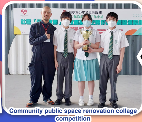
Community public space renovation collage competition