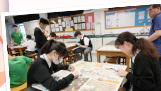
Students working on their leaf bookmarks with precision.

Organized by the IT and Science subject panels, the STEM and Science Week is a delicious blend of scientific experiments and explorations across the week of 22 April 2024 to ignite students' passion in science. Students were highly enthusiastic and showed their interest towards different branches of science, including Information and Communication Technology, Physics, Chemistry, Biology and Integrated Science.