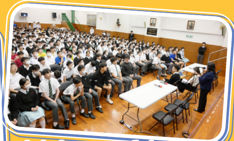
Junior forms were actively engaged in the Inter-house Integrated Humanities Competition, whilst learning more about Chinese history and culture in a fun way.