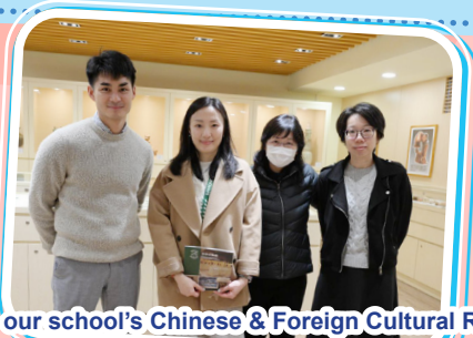
Visit to our school's Chinese & Foreign Cultural Relics Gallery