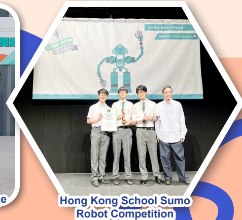
Hong Kong School Sumo Robot Competition