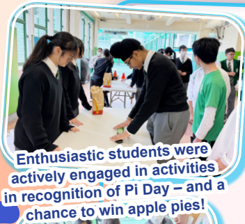
Enthusiastic students were actively engaged in activities in recognition of Pi Day – and a chance to win apple pies!

Our Mathematics teachers dedicated a lot of effort to organize activities to foster students' interests and abilities in Mathematics through the week of 11 to 14 March 2024.